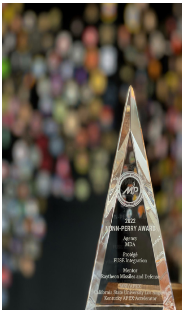
Fuse Integration’s 2022 Nunn-Perry Award

Of course, the San Diego military community is surrounded by both large and small defense contractors. Most of the big aerospace and defense companies have a presence, along with small and growing specialty firms designed to expand the capabilities of larger organizations — all creating innovative solutions to improve our nation’s defense capabilities.