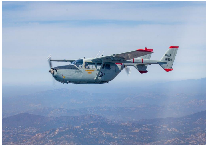
USAF Cessna O-2A aircraft, modified for flight test operations

Montgomery-Gibbs Executive Airport is a local municipal airport in Kearny Mesa. A range of non-military aircraft, from private, corporate, and charter planes to air ambulances, fire rescue, and flight training, keep the airfield busy.