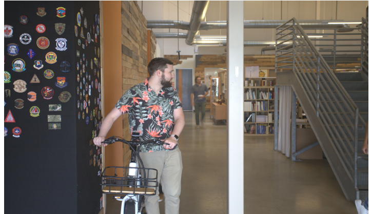
Fuse Integration employee with bike at work

Kearny Mesa is a perfect backdrop for the creative and energetic mindset at Fuse. Just a few minutes from the office, one can enjoy everything from Korean BBQ and Sichuan eateries to craft breweries and unique shopping plazas.