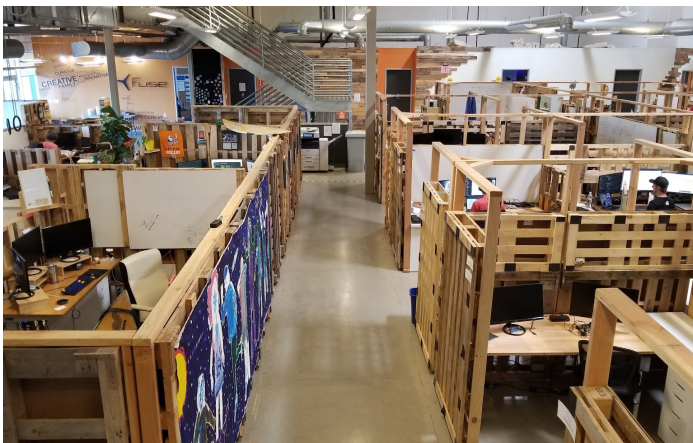
Pallet wood cubicles support privacy & connectedness

As part of the build-out, Fuse created pallet wood cubicles to support the best of privacy and connectedness. As they work on their own, team members can surround themselves with meaningful mementos and reference tools in their dedicated space. Or they can consult with colleagues just a few steps away. If one needs inspiration, a walk around the office features a Lego table, a model aircraft display, and Star Wars décor (including a full-size Storm Trooper at the intersection of two hallways).