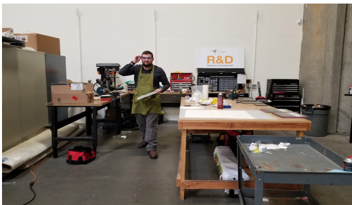
Dedicated research & development space

Fuse designs, prototypes, and tests their products on site and in the air. (Fuse has its own rebuilt USAF O-2A aircraft, modified for flight test operations, that they use to test the performance of their networking systems at a nearby airfield.) So, the Fuse headquarters boasts a large research and design bay, where designers, engineers, and system integrators can safely collaborate, build, iterate, and test their products and solutions.