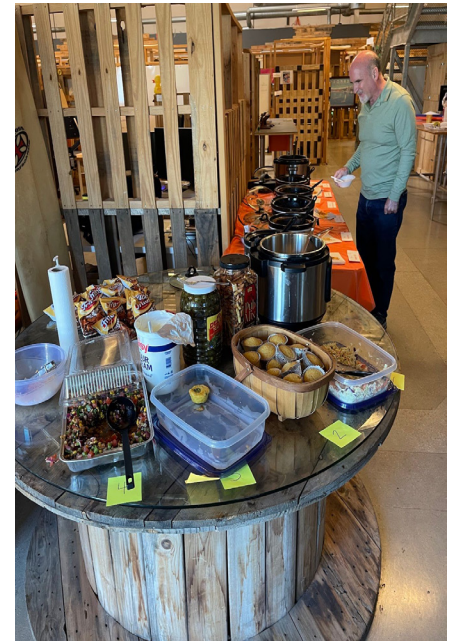
Chili cook-off competition

Barbeques and Friday lunches. Happy hours. Jam sessions. Fuse weeks and months are peppered with company get-togethers for fun and, sometimes, a little competition. Inside, there's plenty of room to host intense chili cook-offs — complete with homemade sides and desserts — where winners get special spoons of recognition and coveted bragging rights. Outside, there's room to host food trucks or grill up some favorite meats and healthy meals.