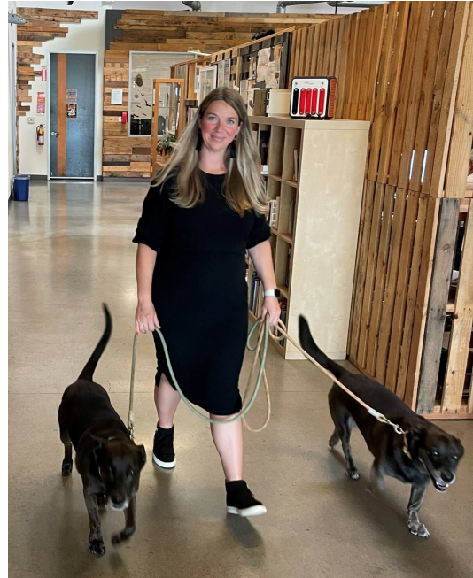
Dogs for a walk at Fuse

Having one's (well-behaved) pet at work is intuitively a plus for pet parents. It turns out that